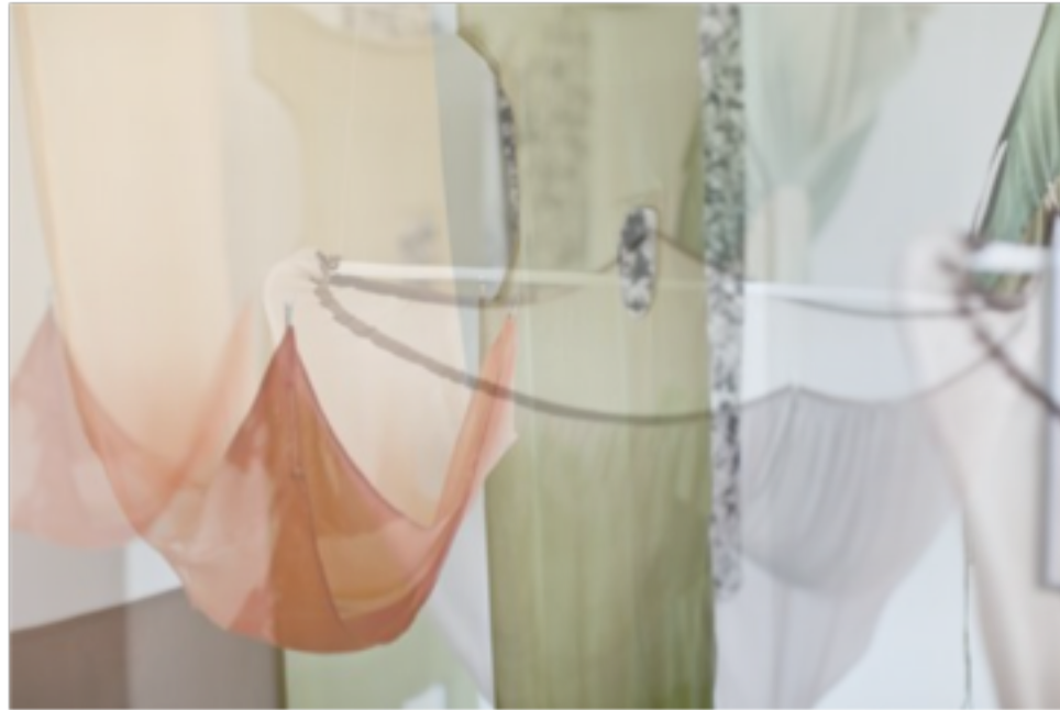
Yiwei Xu, Parami ,